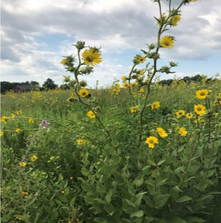
Compass Plant tops waving over the fields