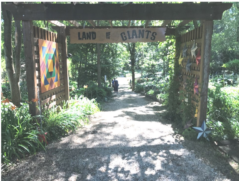
Entrance to The Land of Giant Hostas

The frogs at the Rotary Gardens were about three feet high and four feet wide.