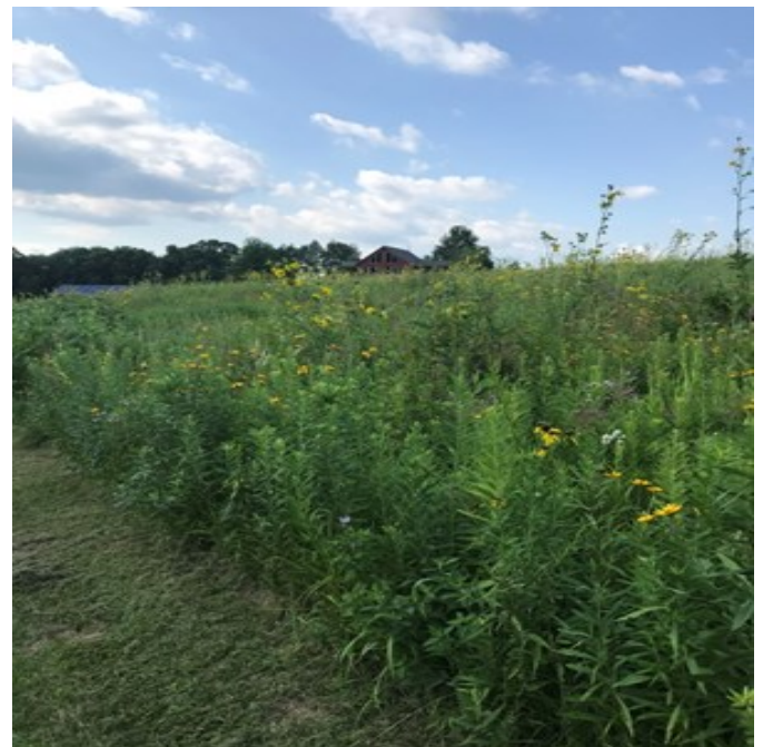
You can just see the top of the house. The Prairie views inside are breath taking.